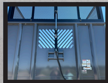
FRONT FOLD DOWN PANEL