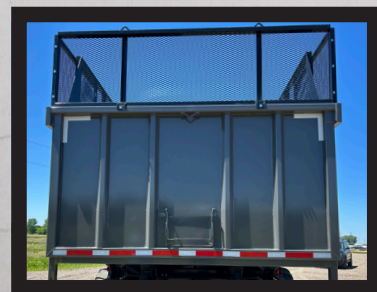
HYDRAULIC LIFT REAR TAILGATE