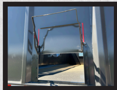
MANUAL LIFT GRAIN DOOR