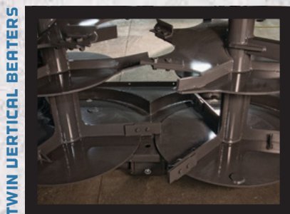
TWIN VERTICAL BEATERS